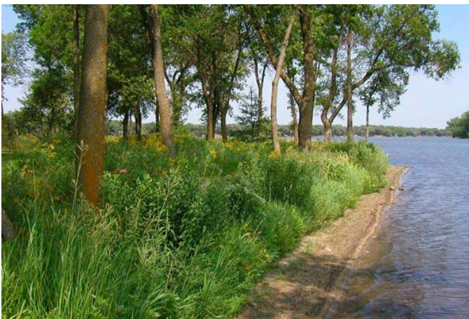
A native plant shoreline buffer.

You are responsible for contacting the Land Services Department once conditions have been completed